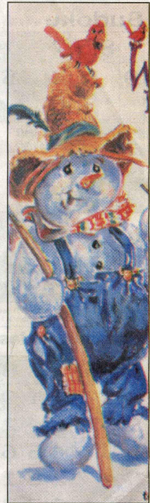
books, visit Red Oak II,

the moods of Red Oak," he said. "There's sunrise, sunset, and in the winter it's magic. I wrote night and day for six days a week. By the last freeze, I was done with it."